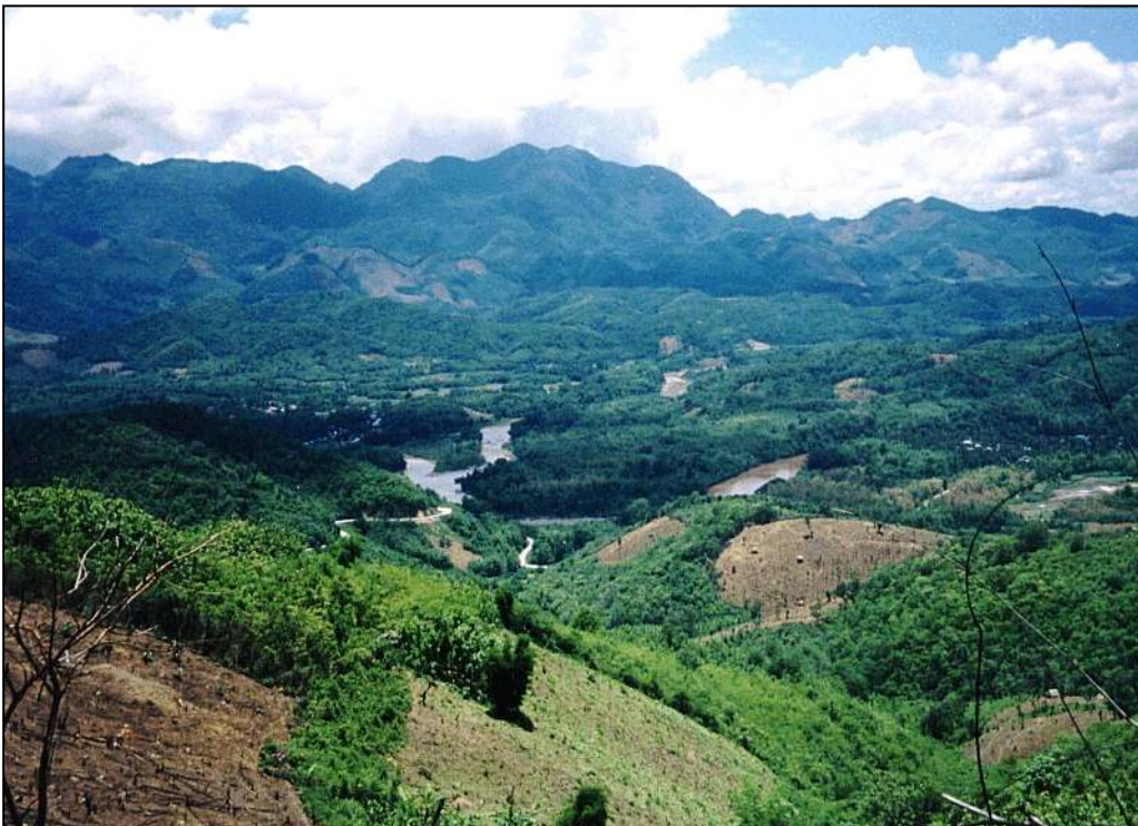
Shifting cultivation in Nam Khan river basin, Laos

In this connection, there is a clear scope for regional knowledge-sharing, since similar problems occur in the countries around Laos.